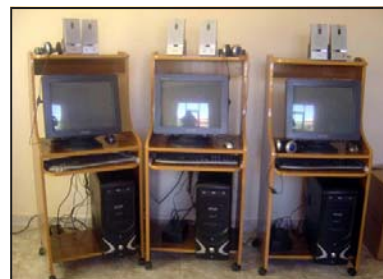
The new computer desks

dren. Recently, the administrator of VH asked Viva Bolivia if we could help them buy three computer desks. Using funds from the sales of Café Yungas, we were able to give them a gift to help buy the desks.