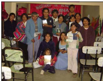
Some of the members of the church

In this very poor area, most of the women work in "La Cancha" (a large, open-air marketplace), selling fruit, toys or other items from small stalls, while the men work in construction as bricklayers or do other manual labor work that is available.