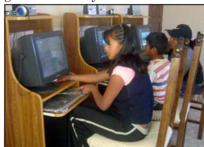
VH kids use the new computer desks.

The new computer desks are much appreciated by the children, as they make the computers much easier and more comfortable to use, especially compared to trying to use the computers without a proper desk! The children use the computers for school work as well as for fun during free times. The personnel have also benefited from these desks, as they use the computers in the day-to-day tasks that are necessary to keep the home running. The children and personnel of VH thanked Viva Bolivia for our continuing support and asked "God's blessing on all the people who help through the ministry of Viva Bolivia."