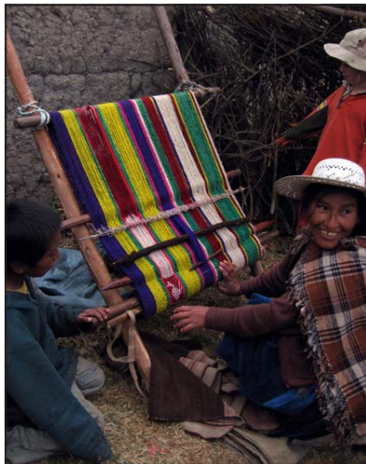
A woman in Candelaria weaves on a simple loom.