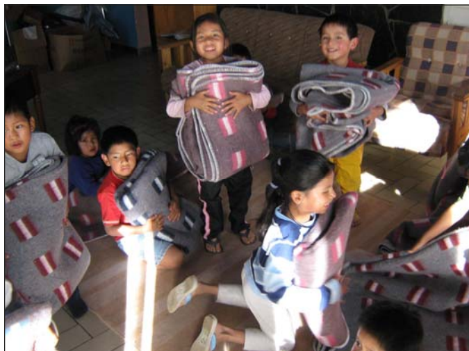
New blankets for children at Casa de Amor!

Casa de Amor (Homes of Love) is a Christian institution that reaches out to and shelters