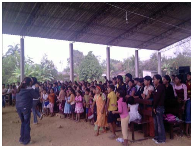
Campers at Ivirza Valley watch a skit and sing.