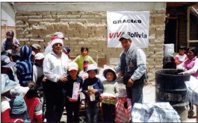
Some of the 225 children who received gifts this past Christmas thank to SIAB.