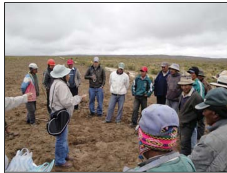
Agronomist giving instruction on planting of Quinoa.