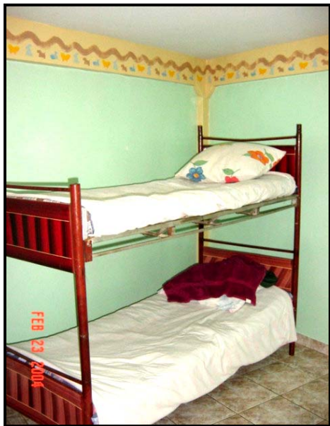
One of the newly painted boys' rooms.