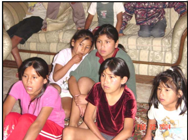
The children watching a children's program on TV.

In February, we hired three new employees: a tutor who is helping out with homework and assisting with school meetings; a coordinator who has the big responsibility of taking care of the children's various needs and making contact with individuals and businesses here in Bolivia who can help the children's home by donating or providing low-cost supplies; and a couple who work as house parents, living with the children every day. We have the same Psychologist.