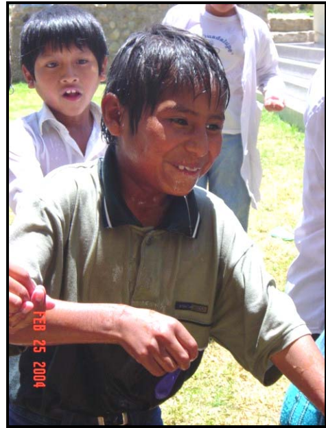
Somebody is totally wet!!!

For a big surprise some of the children got Christmas gifts from their supporters in Sweden this year!! It was cool! At the same time the C.I.C. (Cochabamba International Church) helped us a lot by donating two Christmas gifts for each child! It was a big blessing for us.