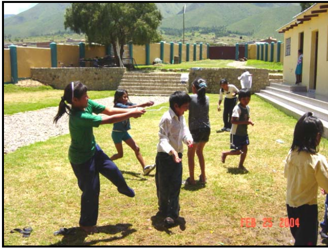
It's fun to play with water!