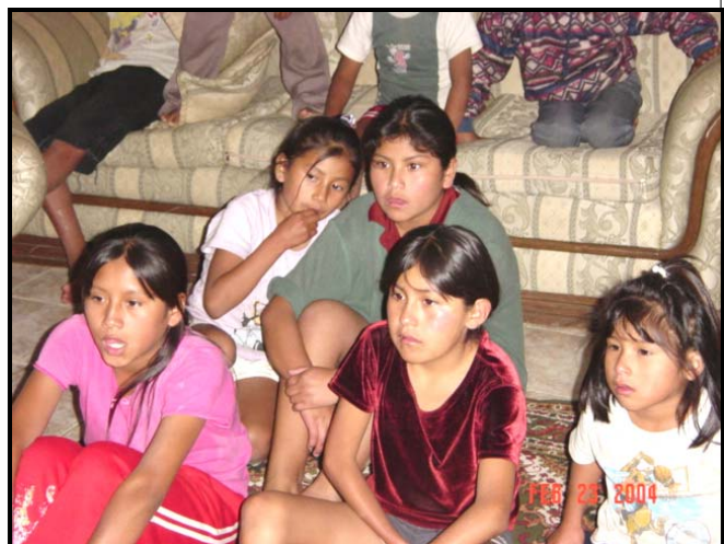
The children watching a children's program on TV.

In February, we hired three new employees: a tutor who is helping out with homework and assisting with school meetings; a coordinator who has the big responsibility of taking care of the children's various needs and making contact with individuals and businesses here in Bolivia who can help the children's home by donating or providing low-cost supplies; and a couple who work as house parents, living with the children every day. We have the same Psychologist.