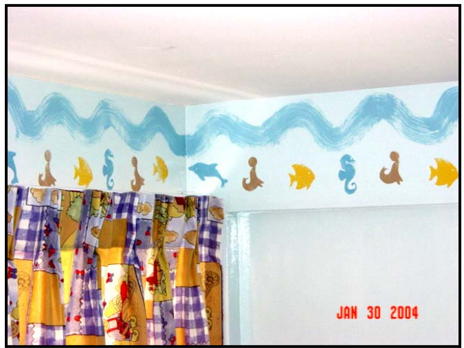
Here is one of the rooms we painted. Isn't it nice?!