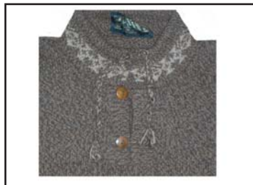
Neck with wood buttons