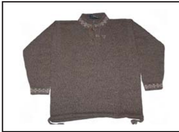
Front Side view

Care: Hand wash and dry flat or dry clean.