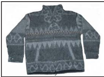
Front Side with Zipper