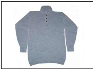
Front Side view

Care: Hand wash and dry flat or dry clean.