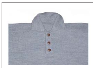
Neck with three wood buttons