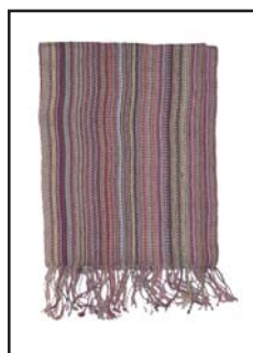
Width w/ Tassel