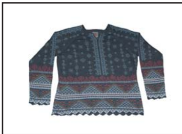
Front Side view

Care: Hand wash and dry flat or dry clean.