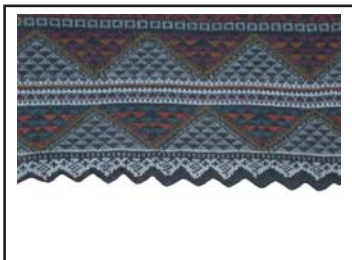
Triangular trim at bottom